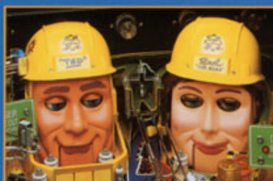
With real hair and eyelashes, Red and Ted are the second generation of Williams' successful PinMation concept.

Hit the road with RED AND TED'S ROADSHOW™. You're guaranteed a good time because Red and Ted are the new, more advanced versions of Williams' blockbuster PinMation™ concept and cousins of FunHouse's Rudy.