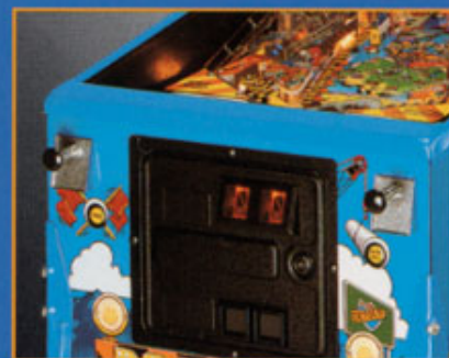
The left-side plunger launches the ball on a skill shot that cracks Ted on the head.

There's a lot to see and do in RED AND TED'S ROADSHOW—more than one player can get to in a single game. That's why we've added a buy-in feature to keep 'em coming back for more, and more...which is exactly what you can count on getting with RED AND TED'S ROADSHOW.